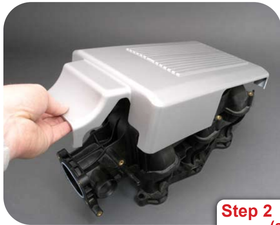
Step 2 (a)

Step 1 Remove the spark plug wire separator—holder from the top rear of the intake plenum and tuck the spark plug wires behind the intake plenum as shown. The wire holder pulls out by firmly pulling up.